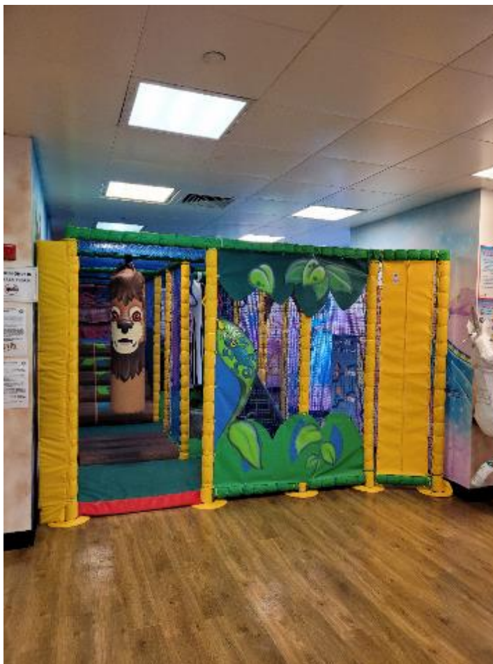
Visits hall (top) which contained soft play (bottom)