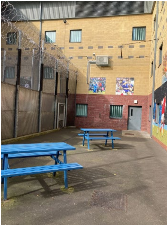
C wing yard