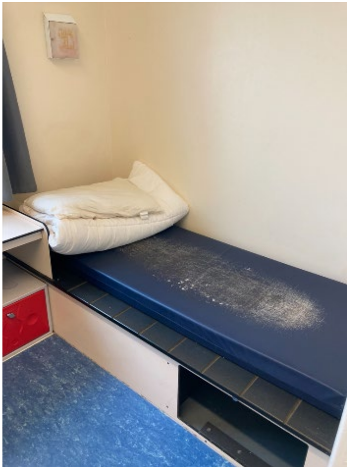
Alpha unit mattress