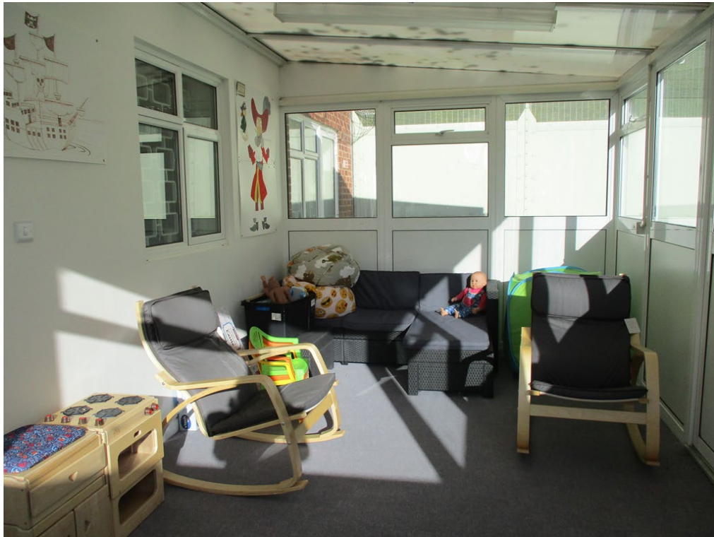
Family bonding unit