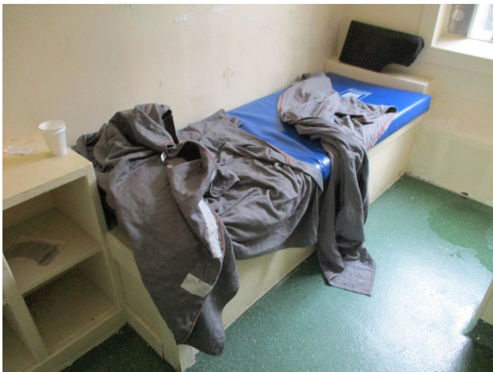
Segregation cell with anti-ligature clothing