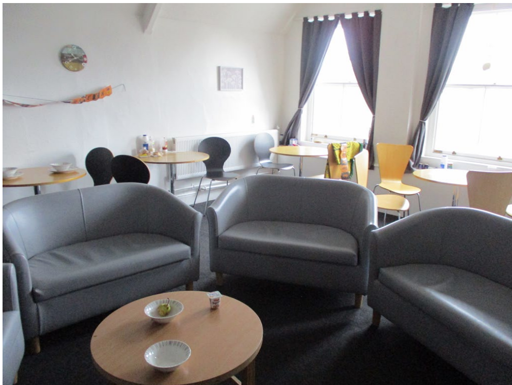
E wing communal eating area