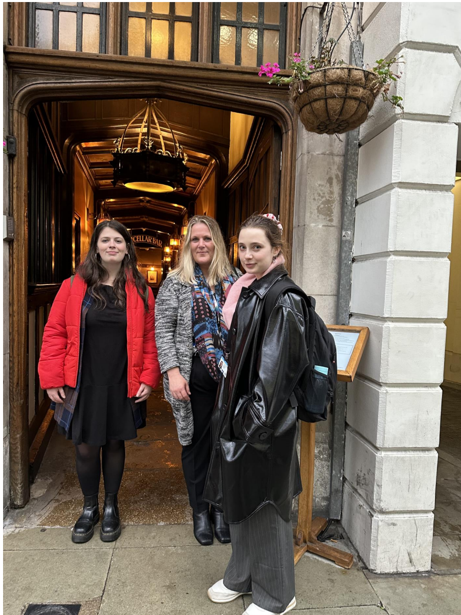
17 - Four Inns of Court Tour