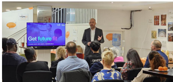
12 - Bounce Back event

Staffordshire University and HMPPS Drug Testing Team explained how HMPPS are tackling the spread of drugs and using screening to not only prevent their entry into prisons but as a vital tool in recognising new psychoactive substances.