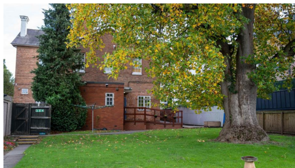
26 - Edith Rigby event

As the Festival drew to a close, attendees shadowed a shift at Edith Rigby Approved Premises in Preston, experiencing the support for women on release from custody and the importance of a trauma informed and relational approach. Edith Rigby House accommodates female residents with a focus on those individuals with personality disorders.