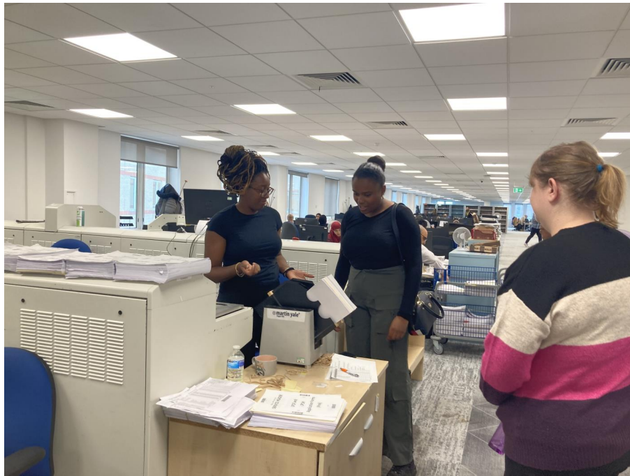
13 - OPG Event

The OPG gave a rare and informative first-hand look at the Lasting Power of Attorney process at their offices in Birmingham. Whilst not directly related to criminal justice, the Public Guardian carries out an essential legal function which ensures that the rights of people unable to represent themselves for various reasons are adequately protected.