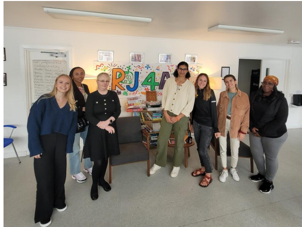
23 - RJ4ALL event

RIFT social enterprise encouraged the exploration of self-employment as a viable option for those with lived experience leaving custody as a vehicle for reintegration and empowerment. The webinar explored RIFT's self-employment support and two-year project developing, delivering and learning from a self-employment support offer to women with convictions, with Insights participants hearing first-hand the challenges and barriers faced by those with criminal convictions.