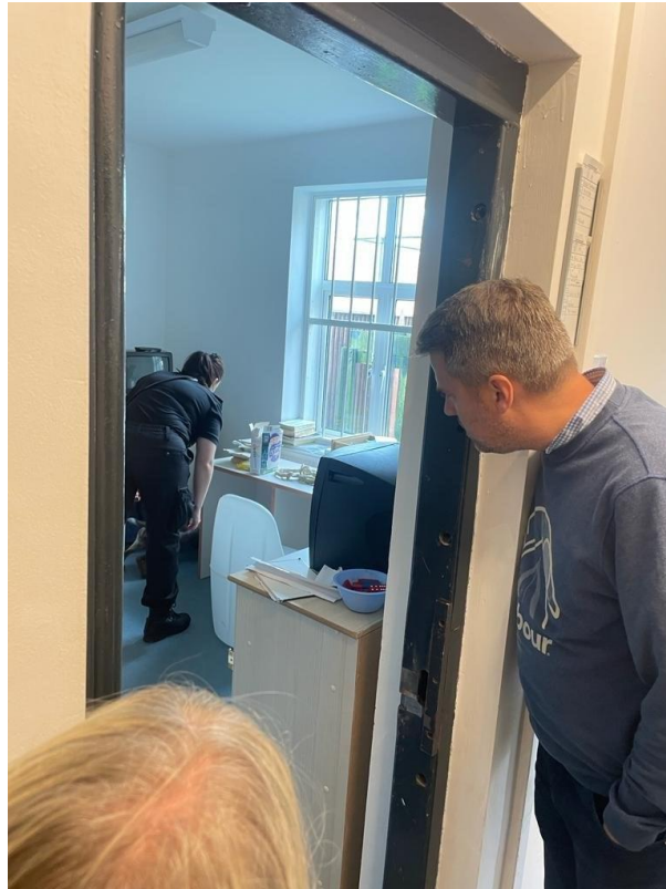
5 - Observing the Six Counties Dog Search Team