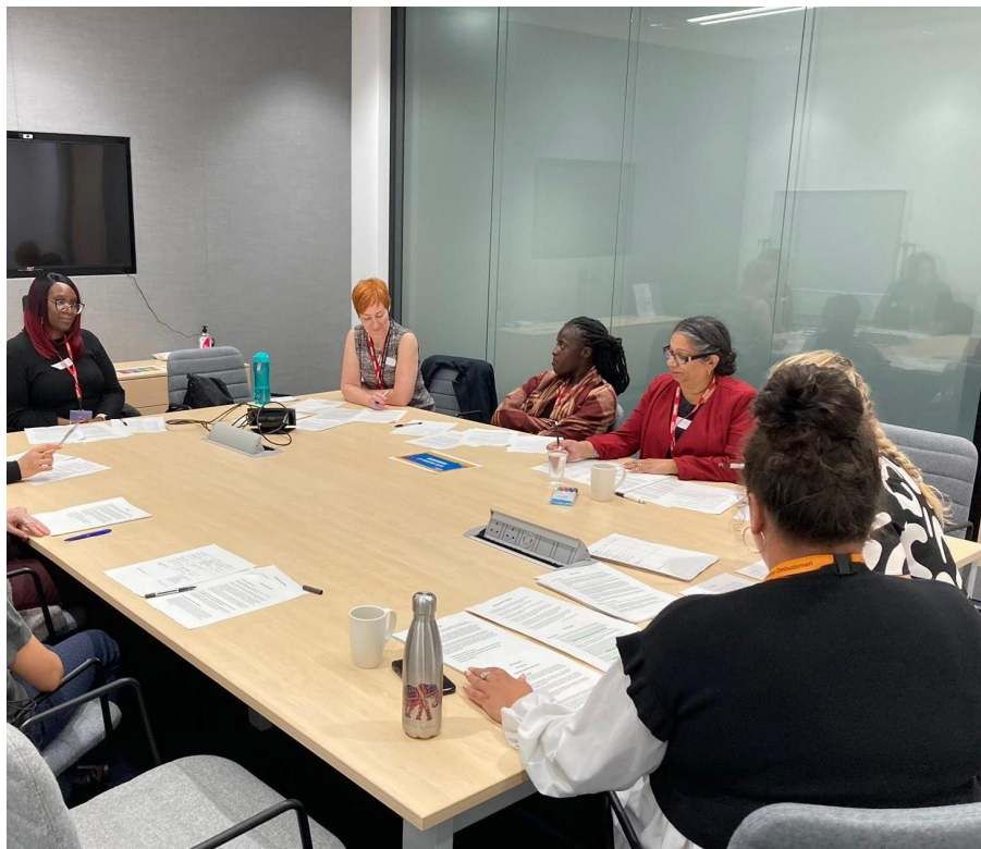
21 - PPO Ombudsman event

Some fortunate ticket holders could also try their hand at simulated investigations as a Prisons and Probation Ombudsman (PPO) Investigator. The PPO carries out independent investigations into complaints and deaths in custody. Read the Insights blog to find out more about why the PPO felt that it was important to be part of the Insights Festival.