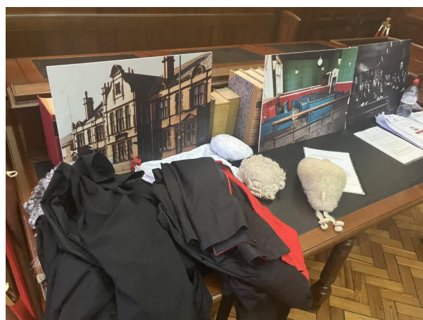
11 - Mock trial at the Greater Manchester Police Museum

HMP & YOI Parc's Invisible Walls Family Services opened their doors, providing an insight into how they help to mitigate some of the hugely disruptive effects of having a family member sent to custody. Demonstrating how working with both prisoners and preserving and promoting family ties can make people's passage through the custodial environment