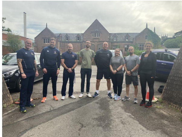
7 - Visit to Lilleshall PE College

be Insights without the dogs and the Search Dog Experience with Six Counties Dog Search Team certainly didn't disappoint, offering a chance to meet the dogs and learn about their important work.