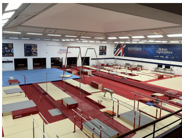
9 - Visit to Lilleshall PE College

Budding broadcasters went backstage at HMP Nottingham's TV studio and HMP Wandsworth's Radio Wanno. A guest at Wandsworth said "I learnt about how prisoners put