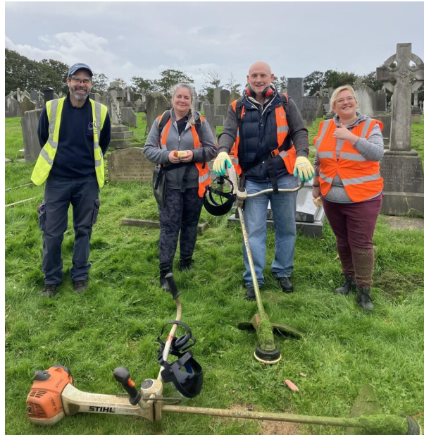
15 - Community Payback