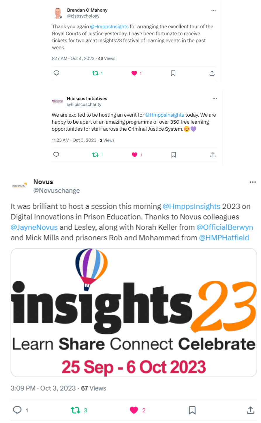
22 - Social media feedback from the Novus event

Recruitment and retention has been a continued focus across the agency so it was interesting to hear how the HMPPS Probation Workforce Programme developed the Probation Service Recruitment and Retention Strategy as well as how they have used technology in probation workforce planning.