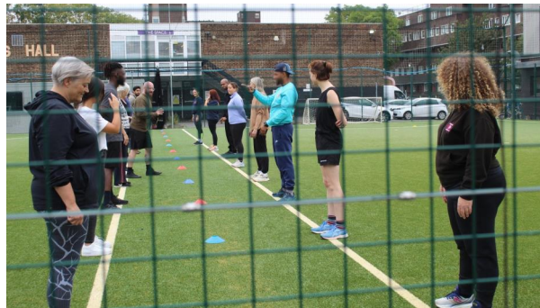
19 - 3 Pillars event

Online, St Giles Wise kicked off their series of 'Perspectives of Probation Talks' with lively discussion about women on probation. The University of Birmingham also shared their research about recruiting and retaining prison staff and what difference a military background makes to the professional culture and approach to prison work.