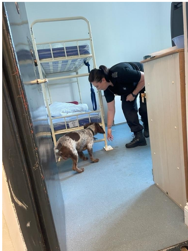
6 - Observing the Six Counties Dog Search Team

We took up the challenge from Lilleshall PE College to pass the national Prison Service fitness test and learnt about the important role played by prison PE instructors. It wouldn't