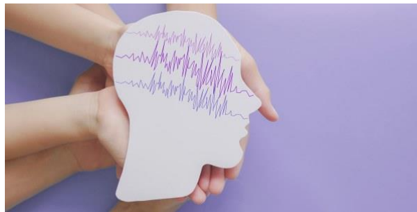
25 - HMPPS Prison Education Service event

The HMPPS Prison Education Service offered an informative look at supporting neurodiversity in prisons and the role of Neurodiversity Support Managers. Attendees heard the issues and challenges highlighted in the 2021 Review of Evidence on Neurodiversity in the Criminal Justice Service and what HMPPS is doing to address these. You can watch the online session recording on the Insights website.