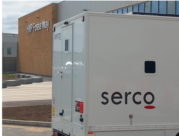
24 - Fosse Way event

The HMPPS Prison Education Service offered an informative look at supporting neurodiversity in prisons and the role of Neurodiversity Support Managers. Attendees heard the issues and challenges highlighted in the 2021 Review of Evidence on Neurodiversity in the Criminal Justice Service and what HMPPS is doing to address these. You can watch the online session recording on the Insights website.