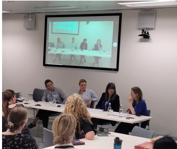
20 - Women in Justice event