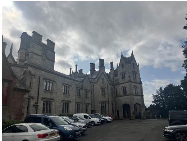
8 - Visit to Lilleshall PE College