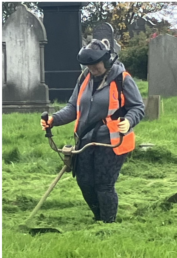
16 - Community Payback