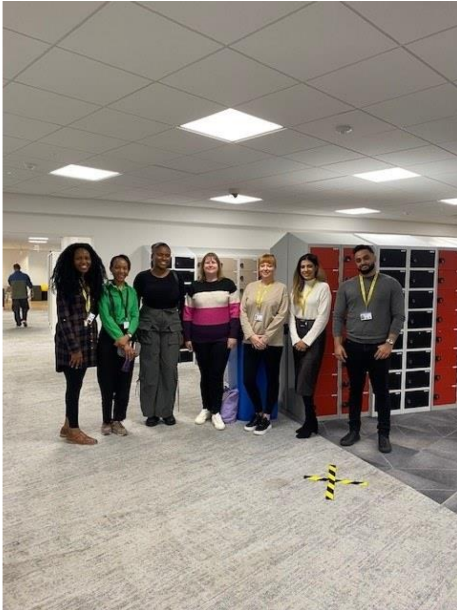
14 - OPG Event

Prisons opening their doors today included HMP Whitemoor High Security prison. A visitor to Whitemoor said, “We were given a full tour of the prison and were able to meet with people in prison for an extended chat. We were also given demonstrations and presentations with the drug dog handlers, the patrol dog handlers. The day completely surpassed my expectations and I could not recommend it enough!”