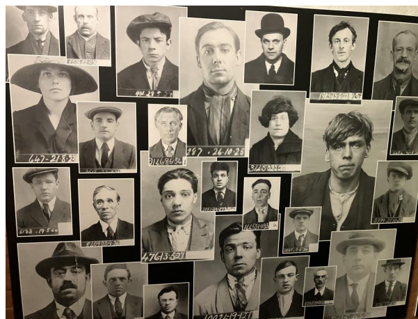
10 - Tour of the Greater Manchester Police Museum

There is evidence that having stable and constructive employment reduces the likelihood someone will re-offend. Bounce Back showcased how their Brighter Futures project supports people to progress into self-employment. Self-employment is about self-discipline and taking personal responsibility - guests heard about people who have committed offences learning these skills and applying them to running their own business.